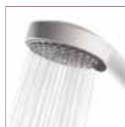
Outer and middle combined