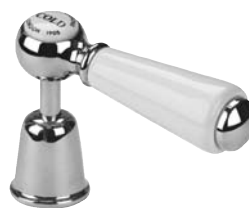
Regent with china lever handles (RFC)