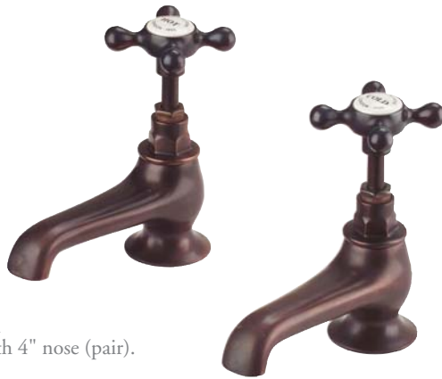
2124 GA style shown ½" basin taps with 4" nose (pair).