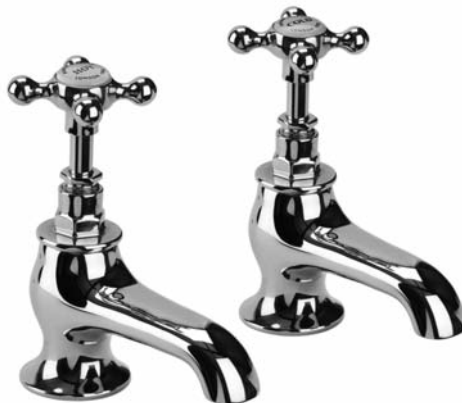
2134 GA style shown. ¾" bath pillar tap with 4" nose (pair).