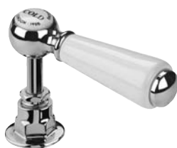
1890s (GA) with china lever handles (GFC)